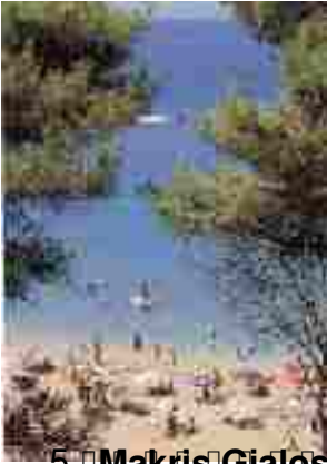
5. Makris Gialos Beach □ □ □ □ □ □ □ □ □