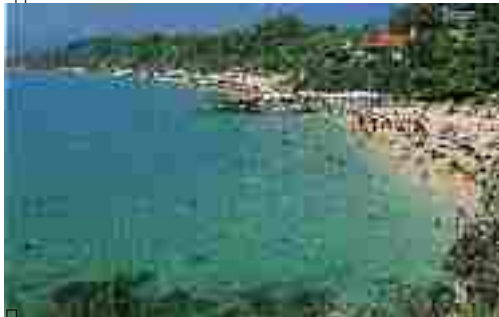
6. Platis Gialos Beach □ □ □ □ □ □ □ □ □