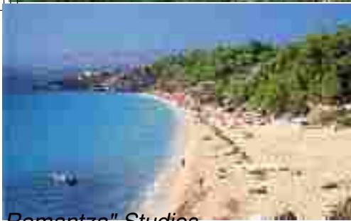
7. Embolis Beach 1km away from "Villa Romantza" Studios